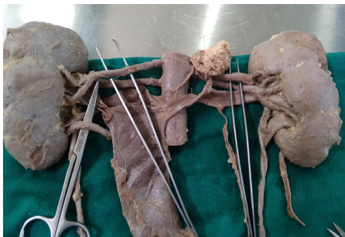
Figure 1) Vascular malformations of kidneys.