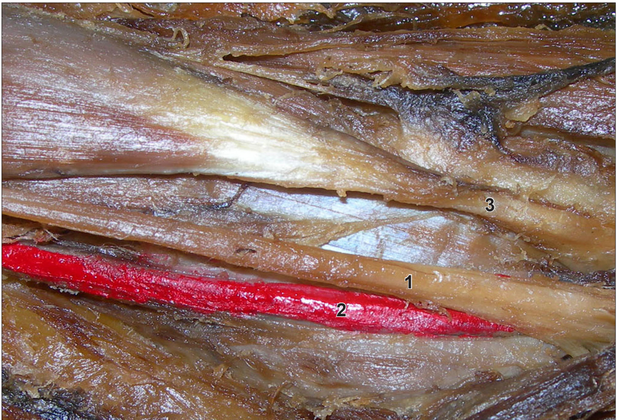
Figure 2. Structures as found in cubital fossa: median nerve lying lateral to the brachial artery. (1: median nerve; 2: brachial artery; 3: tendon of biceps brachii)