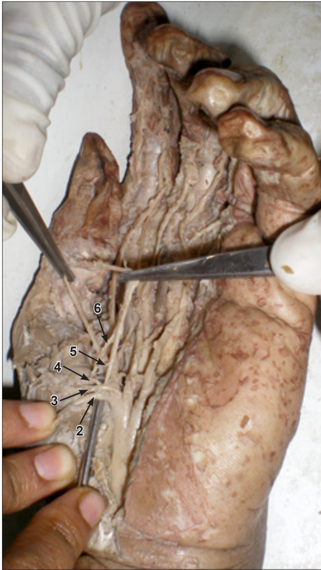
Figure 1. Photograph showing multiple thenar branches (2, 3, 4, 5, 6) of median nerve, except first and seventh.

was observed. Akio studied variations of the branching pattern of median nerve and their variant course in a series of 147 hands in which the carpal tunnel was explored during surgery. One hundred and fourteen hands had one thenar branch, 23 hands two and 10 hands had three branches [3]. Alp et al. studied ramification pattern of the thenar branch in 144 hands of 74 cadavers and found that thenar branch was a single trunk in 84% cases, two branches were observed in 13.2%, three in 2.1% and four branches in 0.7% cases [4].