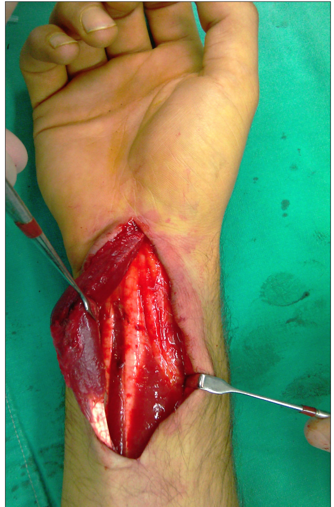
Figure 2. Intraoperative view of the muscle, "the muscular head."

observed that the muscle did not extend to the Guyon's canal. The muscle body and tendon were excised (Figures 1-4).