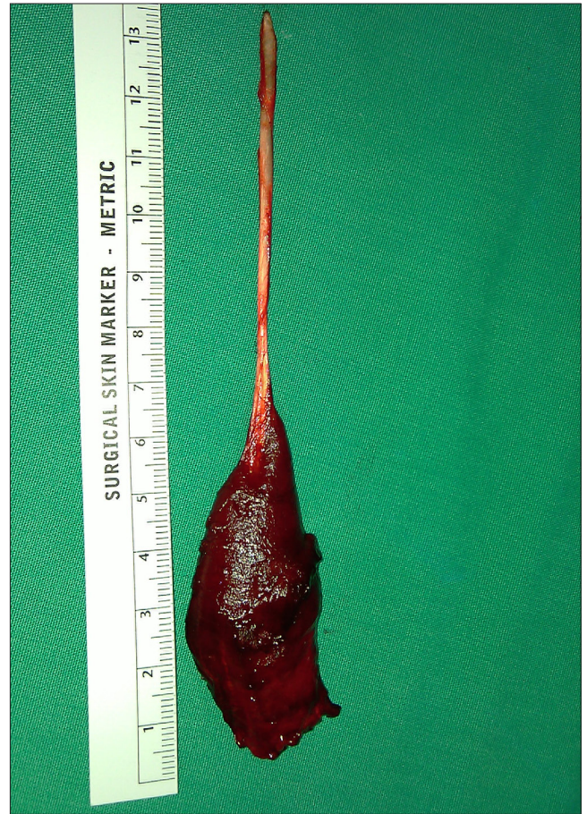
Figure 4. The dimensions of the resected muscle.