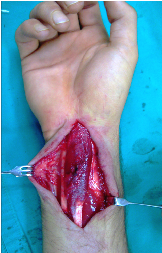
Figure 1. Intraoperative view of the palmaris longus muscle.