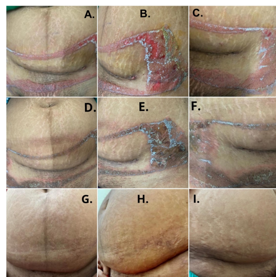
Figure 3) (A-C) Multiple erythematous papules coalescing to form plaques along with few vesicles and erosions, nearly rectangular in shape (D-F) After 7 days-marked decrease in erythema, hyperpigmentation and Crusting seen (G-I) Post 3 weeks forearm lesion healed with hyperpigmentation