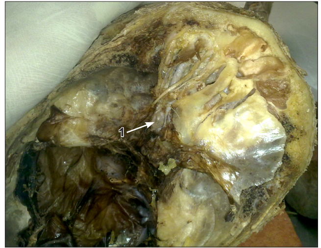
Figure 2. Photograph showing carotid-ophthalmic aneurysm (1) after removing the left optic canal.

carotid artery at its division [5]. Observations recorded by Guidetti and La Torre revealed the locus of this dilatation superior to the cavernous sinus and inferior to the origin of posterior communicating artery [3].