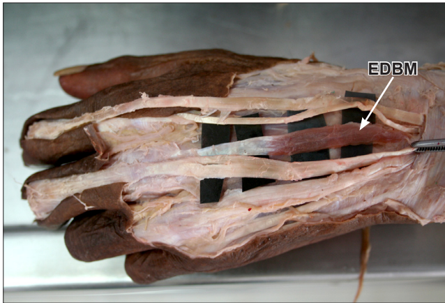
Figure 2. Photograph of extensor digitorum brevis manus muscle originated from the left wrist joint capsule and dorsum of the carpal bones. ( EDBM: extensor digitorum brevis manus muscle )