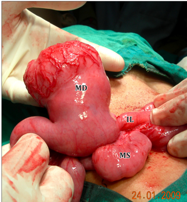
Figure 1. Meckel's diverticulum ( MD ) attached to ileum ( IL ). ( MS : mesentery)