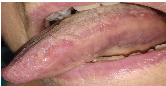
Figure 3) Migratory glossitis

squamous epithelium posteriorly, which is directly attached to the underlying muscle, while the underlying lamina propria is composed of dense fibrous connective tissue with numerous vessels and nerves supplying papillae (14). At the diagnosis the length of filiform papillae in BHT is >3 mm while the normal length is <1 mm (15). Some studies showed a prevalence of BHT of 40% in patients over 60 years old (16). Patients with oncological disorders, smokers, HIV-positive patients, edentulous patients and those with poor oral hygiene are most involved (4). Although casual smoking poses a slightly increased risk of having BHT compared to non-smokers (15% to 10% in men, 5.5% to 5.2% in women), habitual use of tobacco leads to estimated prevalence of 58% in men and 33% in women; also the excessive black tea consumption lead to increased prevalence of BHT in both male and female patients (17).