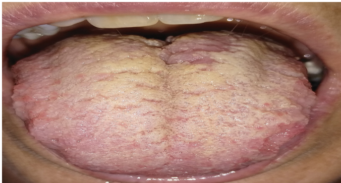
Figure 2) Hairy tongue and scrotal tongue