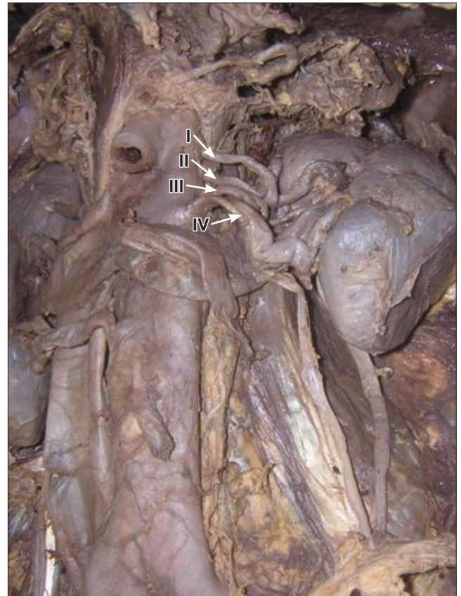
Figure 2. Photograph showing left kidney with four renal arteries. ( I : left renal artery-1; II : left renal artery-2; III : left renal artery-3; IV : left renal artery-4)

artery) in 0.4% of cases (1/266), irrespective of side [7]. In the present case, we also found 4 LRA; the second LRA was reaching the superior pole of left kidney. The variations in both right and left renal arteries make this case unique,