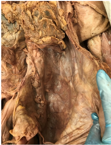
Figure 1) The descending colon (DC) is displaced close to the midline with a widened left paracolic gutters (PG).

The anomalous sigmoid colon consisted of two segments: a redundant ascending part and a normal descending part. The ascending sigmoidal loop took a sharp turn superiorly as soon as it emerged from the end of the descending colon. It ran continuously upward, parallel but in opposite direction to the descending colon, until it reached the splenic flexure at the vertebral level of T11. The ascending loop was centrally placed and