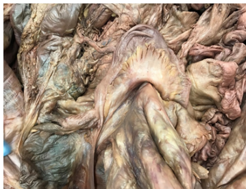
Figure 2) The left paracolic gutter is occupied by loops of small intestine, jejunum (J) and ileum (IL).