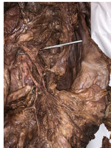
Figure 4) The Inferior mesenteric artery (IMA) gives rise to a common trunk that splits into left colic (red arrow head) and two additional sigmoid branches (white arrow heads) supplying the redundant ascending part. The descending part is supplied by another sigmoid artery (yellow arrow head) from IMA.

Usually, the descending and sigmoid colons are supplied by branches of inferior mesenteric artery: descending colon by the left colic branch and sigmoid colon by sigmoidal branches [1]. In the present case, the redundant ascending part of the sigmoid was perfused by the left colic branch and two sigmoidal branches, all of which originate from a common trunk arising from the inferior mesenteric artery. The descending part is supplied by an additional sigmoidal branch which directly arose from the inferior mesenteric artery (Figure 4).