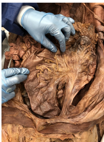
Figure 3) The redundant ascending part of sigmoid colon measures 11.2” long reaching splenic flexure while the descending part of sigmoid colon measures 12” long.

measured 11.2 inches long. Its circumference appeared normal (Figures 3 & 5). The ascending loop of sigmoid colon, or dolichosigmoid, was completely redundant and very rare.