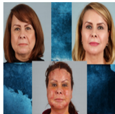
Fig.2. Patient with one week, hen 120 days and then 90 days