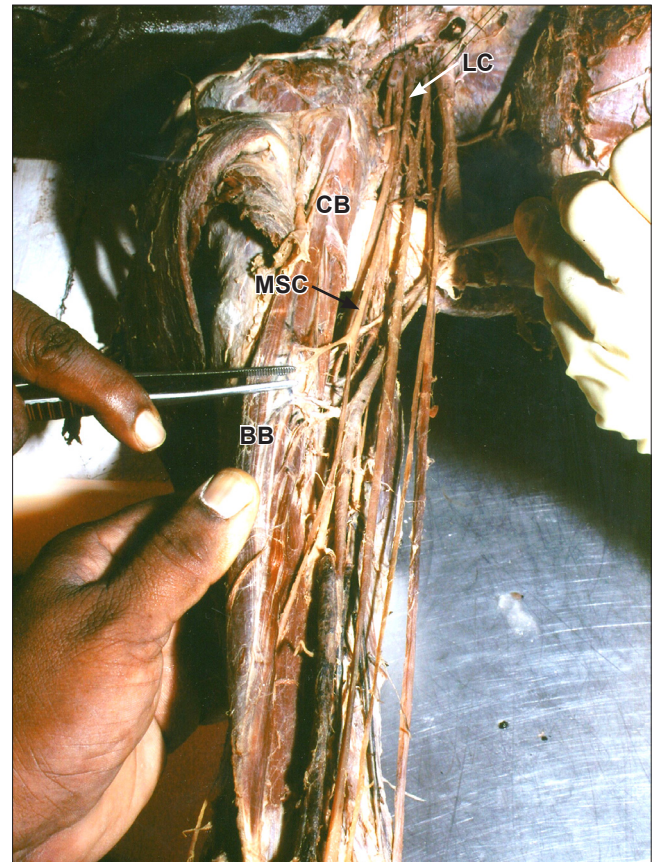
Figure 2. Musculocutaneous nerve is not piercing coracobrachialis muscle. ( LC : lateral cord; CB : coracobrachialis muscle; MSC : musculocutaneous nerve; BB : biceps brachii muscle)

descended and supplied the muscles of the arm [8]. In the present report also the musculocutaneous nerve was not piercing coracobrachialis muscle and descended lateral to the brachial artery and supplied the muscles of the arm. These variations in the relationship of cords of the brachial plexus and their branches with the axillary artery can be explained embryologically. The upper limb buds lie opposite the lower five cervical and upper two thoracic segments. As soon as the buds form, the ventral primary rami of the spinal nerves penetrate into the mesenchyme of limb bud. Immediately the nerves enter the limb bud, they establish intimate contact with the differentiating mesodermal condensations and the early contact between nerve and muscle cells is a prerequisite for their complete functional differentiation [9,10]. The variations could arise from circulatory factors at the time of fusion of the brachial plexus cords [11]. In man, the forelimb muscles develop from the mesenchyme of the para-axial mesoderm during fifth week of embryonic life [10]. The axons of spinal nerves grow distally to reach the limb bud mesenchyme. The peripheral processes of the motor and sensory neurons grow in the mesenchyme in different directions. Once formed, any developmental