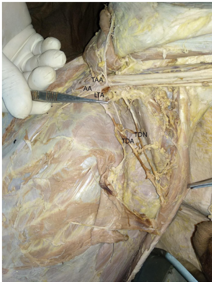
Figure 2) Showing the branches of second part of axillary artery on left side. (AA – axillary artery, TAA – thoraco-acromial artery, LTA – lateral thoracic artery, TDA – Thoraco dorsal artery, TDN – thoraco dorsal nerve).