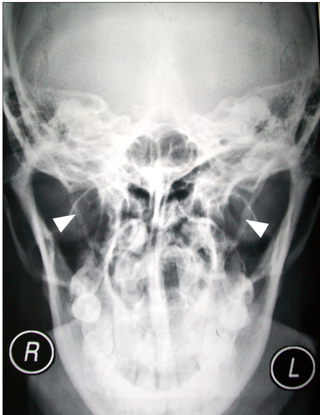
Figure 1. Photograph shows the bilateral asymmetrical ossification of the stylohyoid chain ( white arrowheads ).

Pathogenesis of elongation and mineralization of the stylohyoid chain is poorly understood as described in