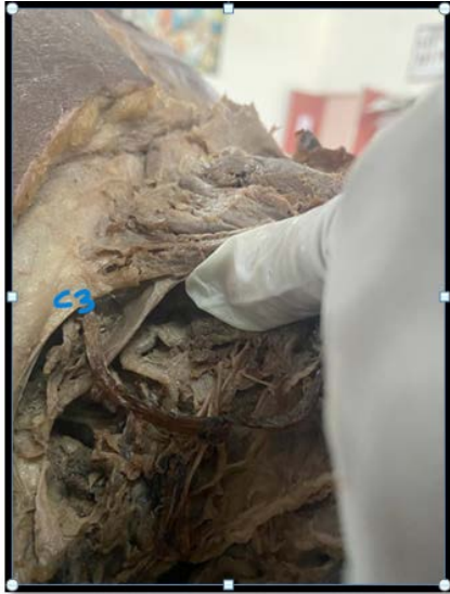
Figure 2) C3-3rd Clavicular head.