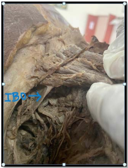
Figure 3) IOB- Inferior Belly of omohyoid.