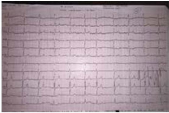
Figure 2) EKG of control has found restitution of atrial fibrillation at rate of 59/min

The treatment is based on two main sources: Treatment of the atrio-ventricular block and palliation against tissue hypoperfusion on the one hand; On the other hand decreasing the plasma potassium concentration, combating its effects on myocytes and treating the cause of hyperkalemia. When the heart block is complete, Patients with clinical hypo perfusion or not responding to medical measures may have a continuous monitoring and treated by percutaneous pacing as a temporary or conclusive solution (9,10). Hyperkalemia should be treated as quick as possible, by antagonizing the extracellular potassium effect thus decreasing the serum potassium level by transferring on intracellular. The next line is to remove potassium from the body by 'Kayexalat' or ultimately by hemodialysis (11-13). As the case of our patient, the evolution is good after early treatment.