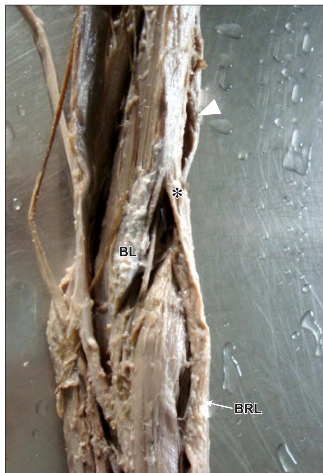
Figure 3. Dissection showing fused higher origin of brachioradialis with brachialis and medial head of triceps. ( BRL : brachioradialis; BL : brachialis; white arrowhead : higher origin of brachioradialis fused with medial head of triceps; asteriks : higher origin of brachioradialis fused with brachialis)