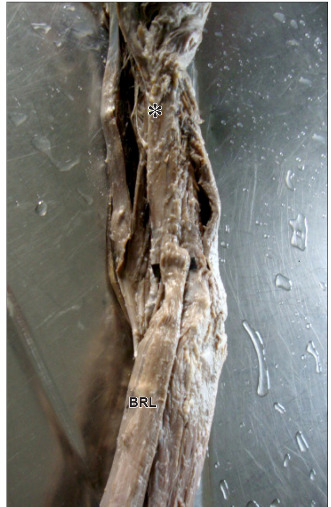
Figure 2. Dissection showing fused higher origin of brachioradialis with brachialis. ( BRL : brachioradialis; asteriks : higher origin of brachioradialis fused with brachialis)

also known as the humeral head or third head of the biceps brachii muscle. According to present studies, this variation varies in different population, Chinese 8%, European White 10%, African Black 12%, Japanese 18%, South African blacks 20.55%, South African whites 8.35% and Colombian 37.5% [4].